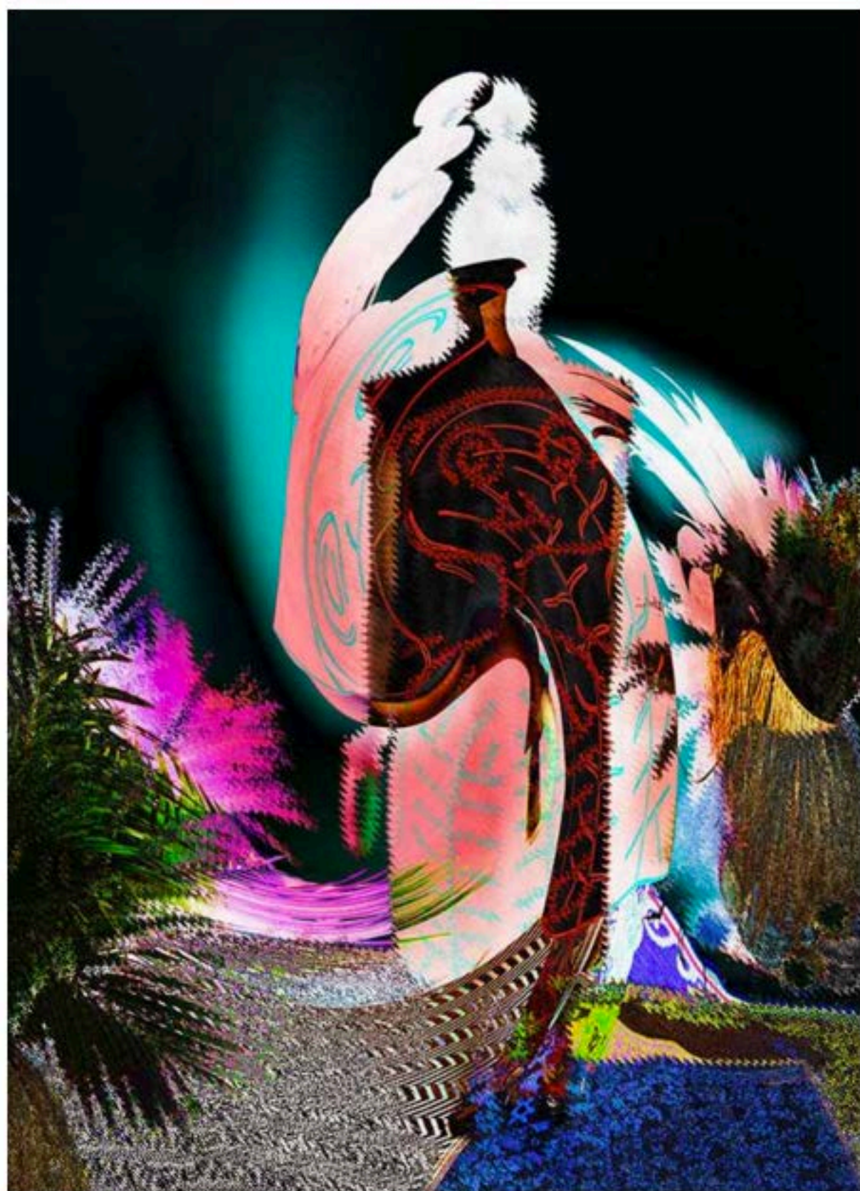
Namsa Leuba, Layo, from the series NGL, 2015. Courtesy the artist and Art Twenty One, Lagos

Iduma: In your photographs, I get the sense that color isn't merely a technical choice, particularly because you often construct environments for your subjects. What do you have in mind when you're assembling colors for the costumes and when you're choosing what to photograph?